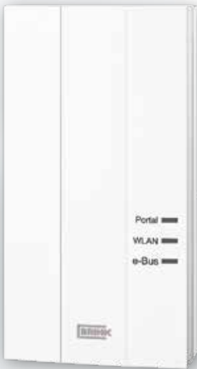
Brink Home Module

Brink Home is composed of the Brink Home Module and the Brink Home App that are connected with the Renovent and may be equipped with the timer control module Air Control. The Brink appliances of the Renovent series are then accessible through a (W)LAN router or the Brink Portal Server. The Brink Home App for smartphone and tablet is available for Android and iOS.